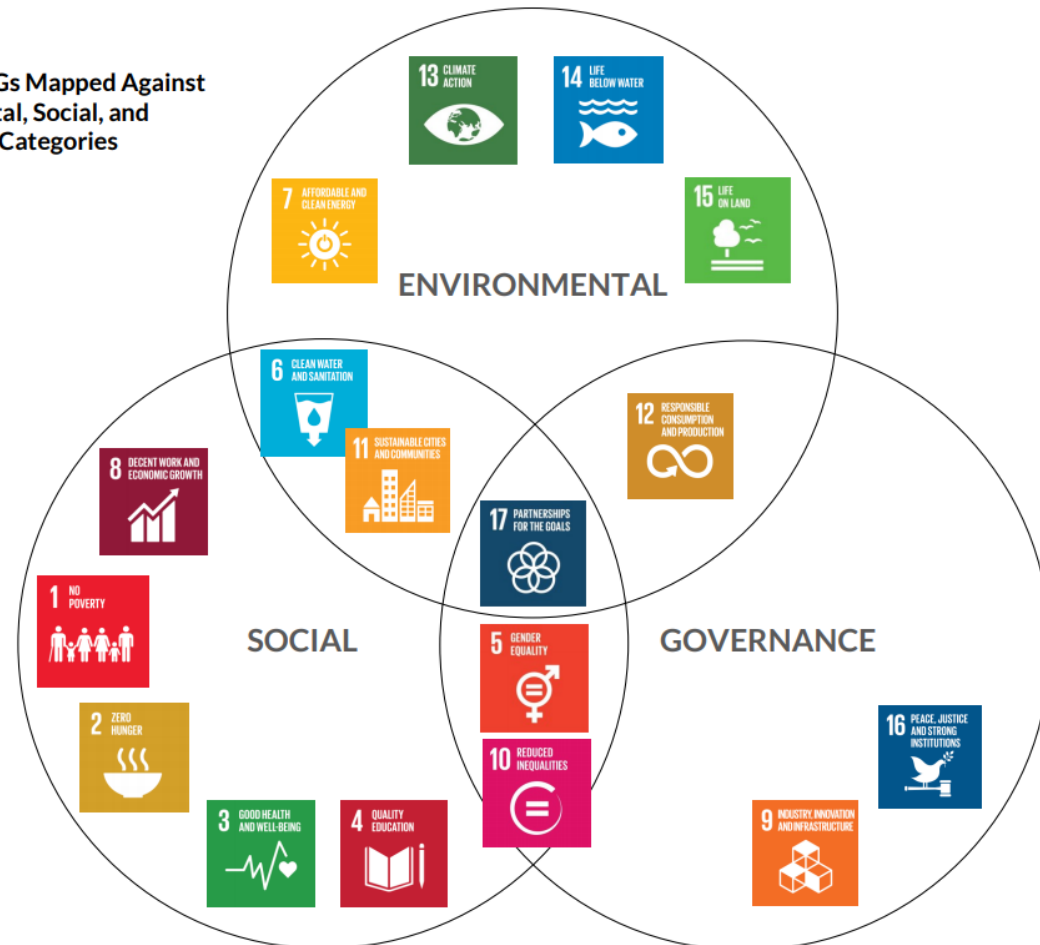
Figure 1: SDGs Mapped Against Environmental, Social, and Governance Categories